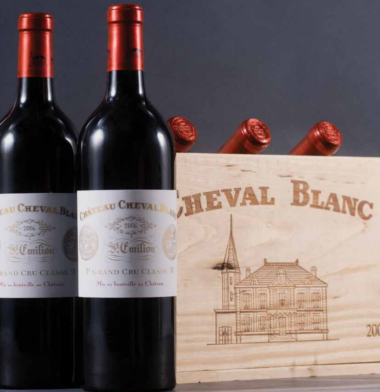
Lots 9 & 10