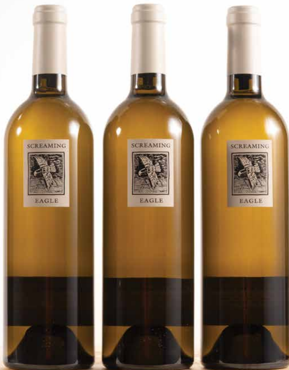
Lots 660 & 661