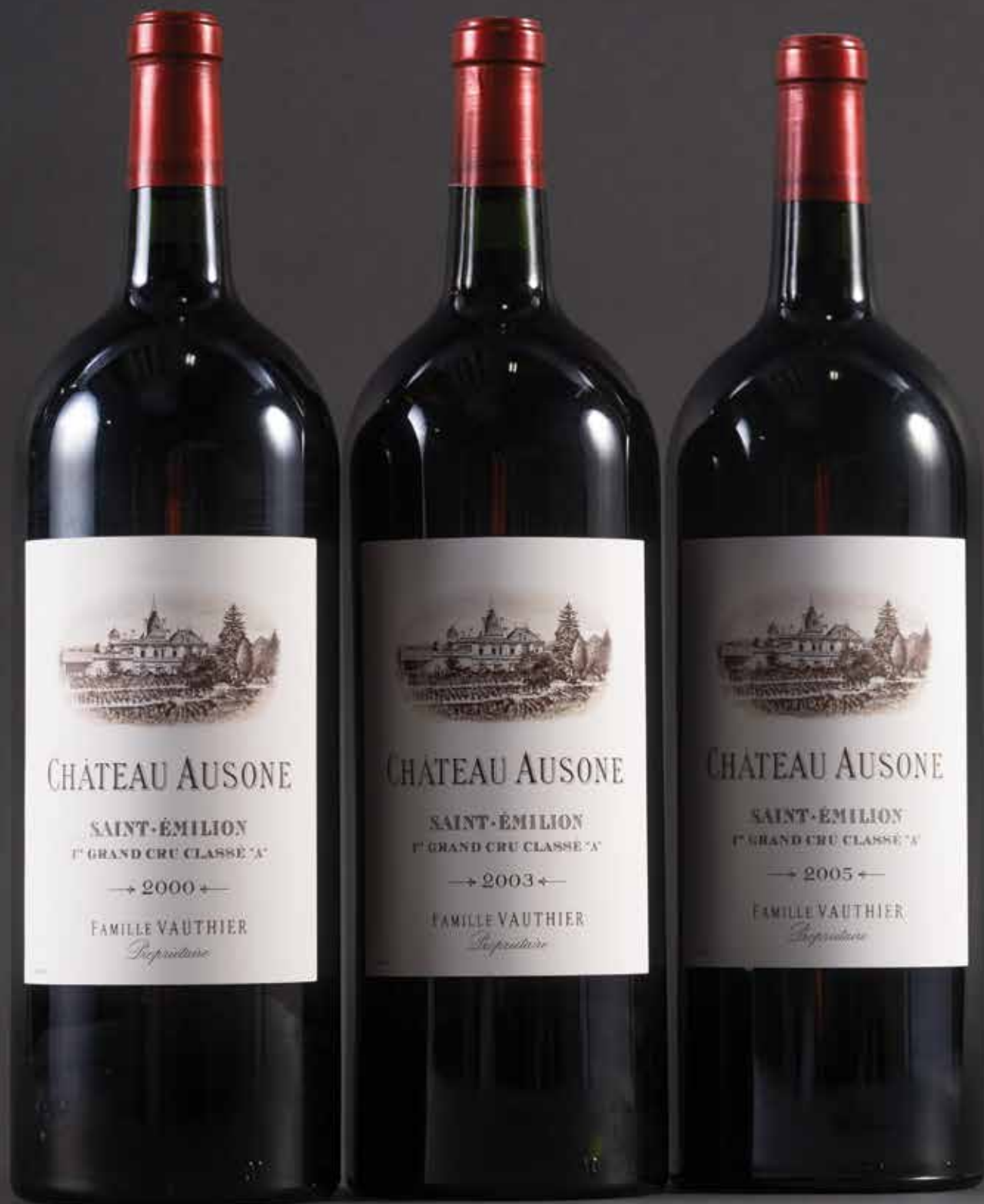
Lots 4 & 5