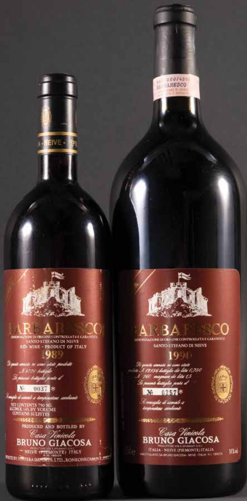
Lots 498 & 500